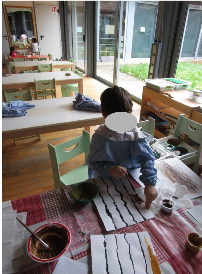
PAINTINGS WITH COLOUR'S SHADES