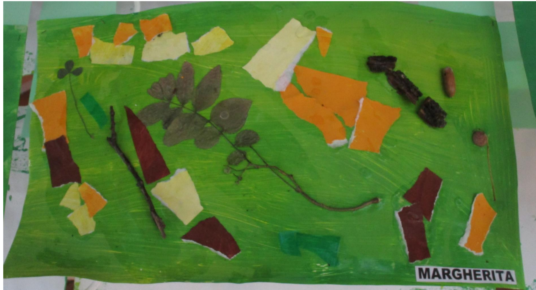
COLLAGE OF MATERIALS